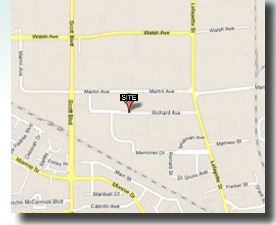
1129 Richard Ave.